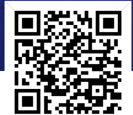
Scan QR code for more info