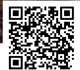
Scan QR code for more info