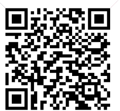
Scan QR code for more info