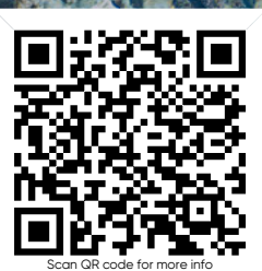
Scan QR code for more info